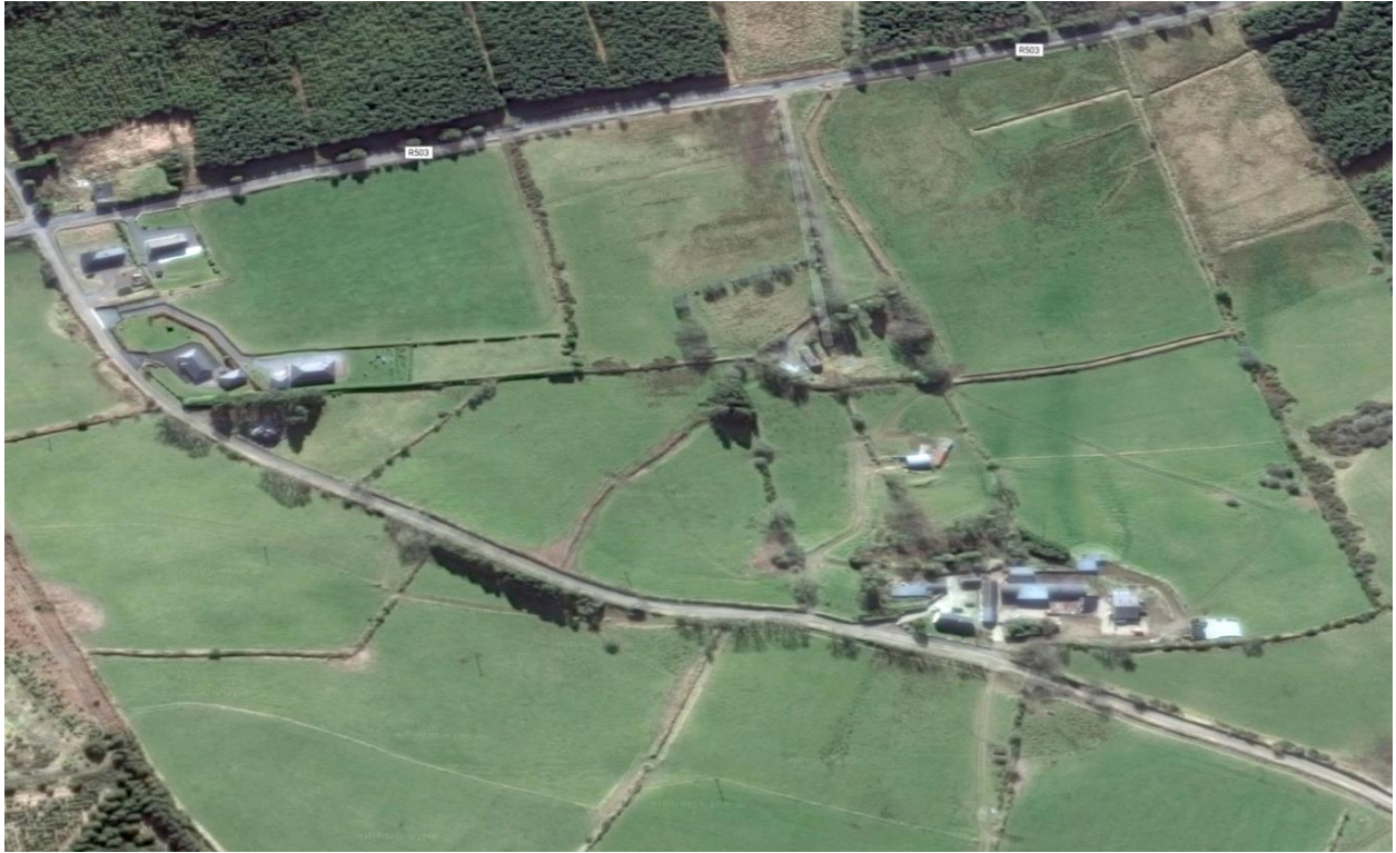
This is a 2016 picture of the Loughbrack townland looking south.