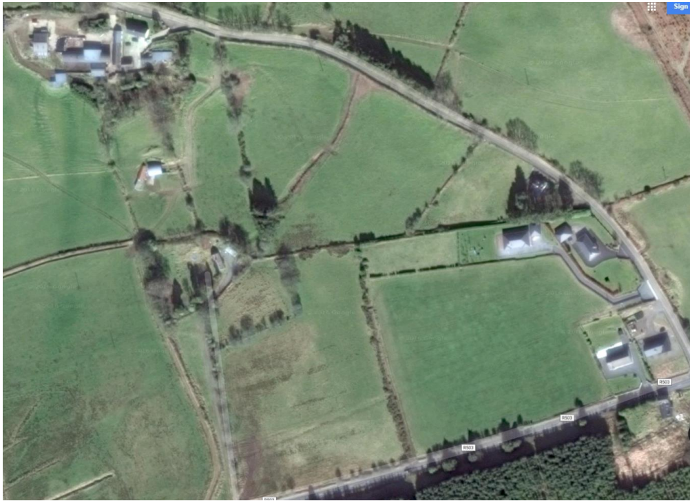
The upper picture of the eastern portion of the Loughbrack townland is from 2005 and the one below it is from 2016.